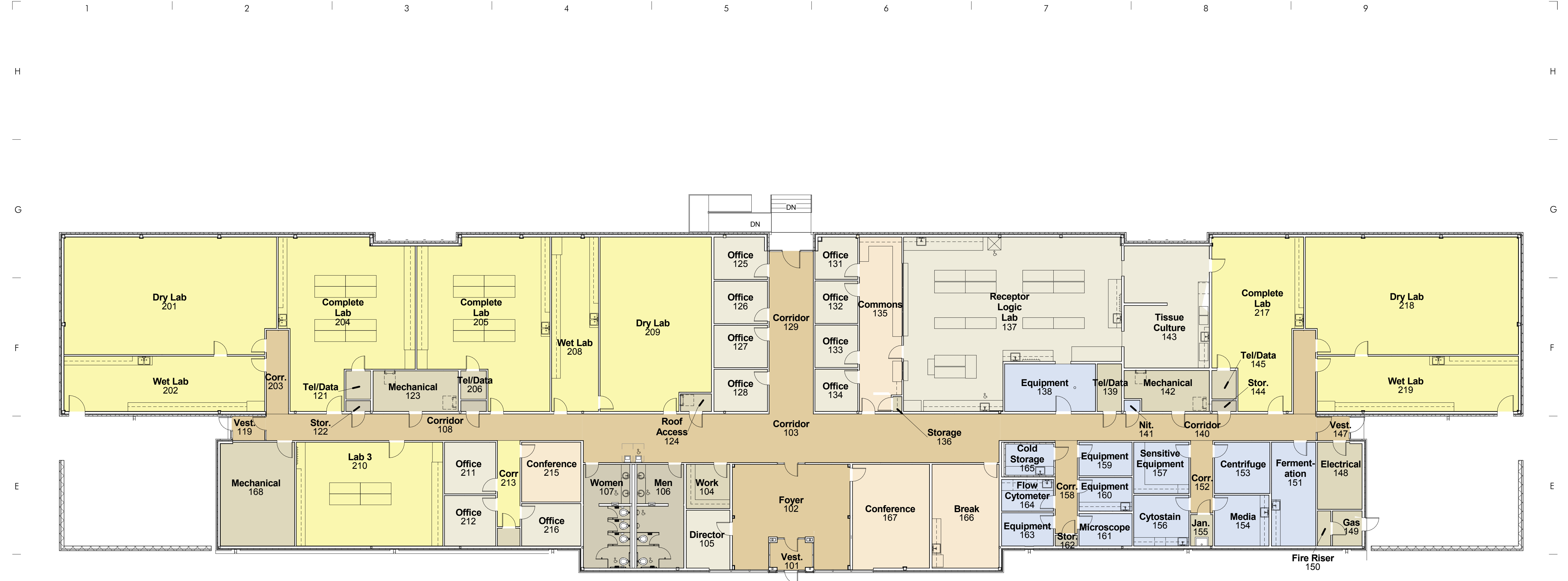
Floor Plan - Presentation 1 : 145